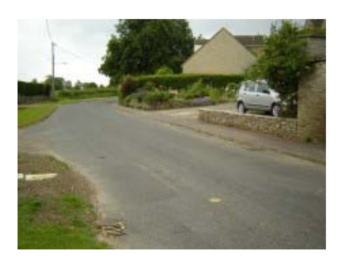
Area 4 - Junction at Green End