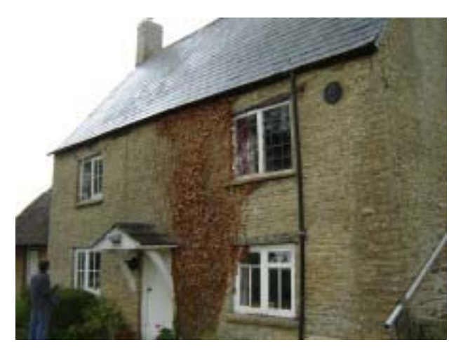
Area 2 - Boot Cottage