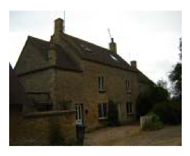
Area 2 - Brook Piece