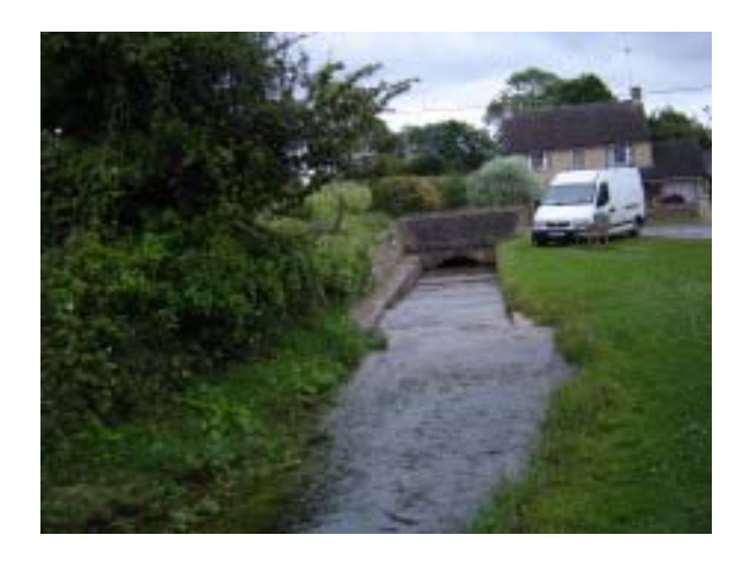
Area I - Brook course culvert Brook End