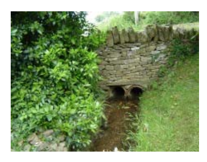
Area 4 - Field wall at Greywalls