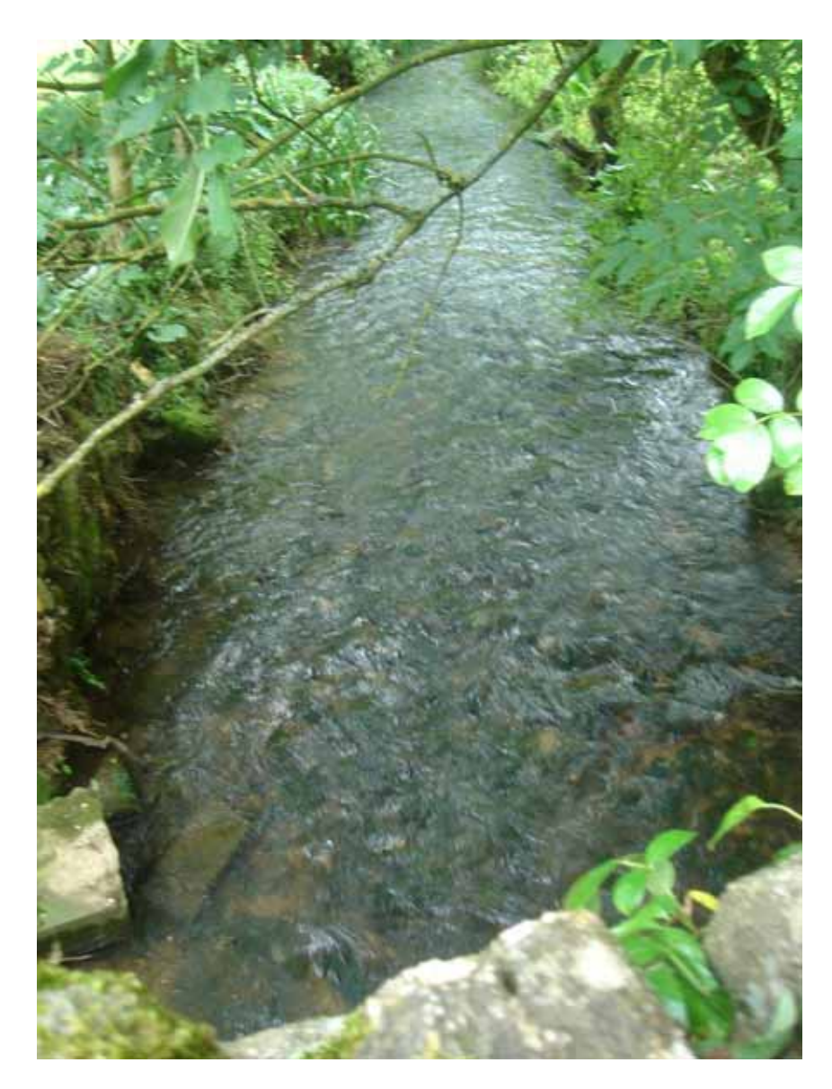
Area 1 – Coombe Brook, from southern bridge