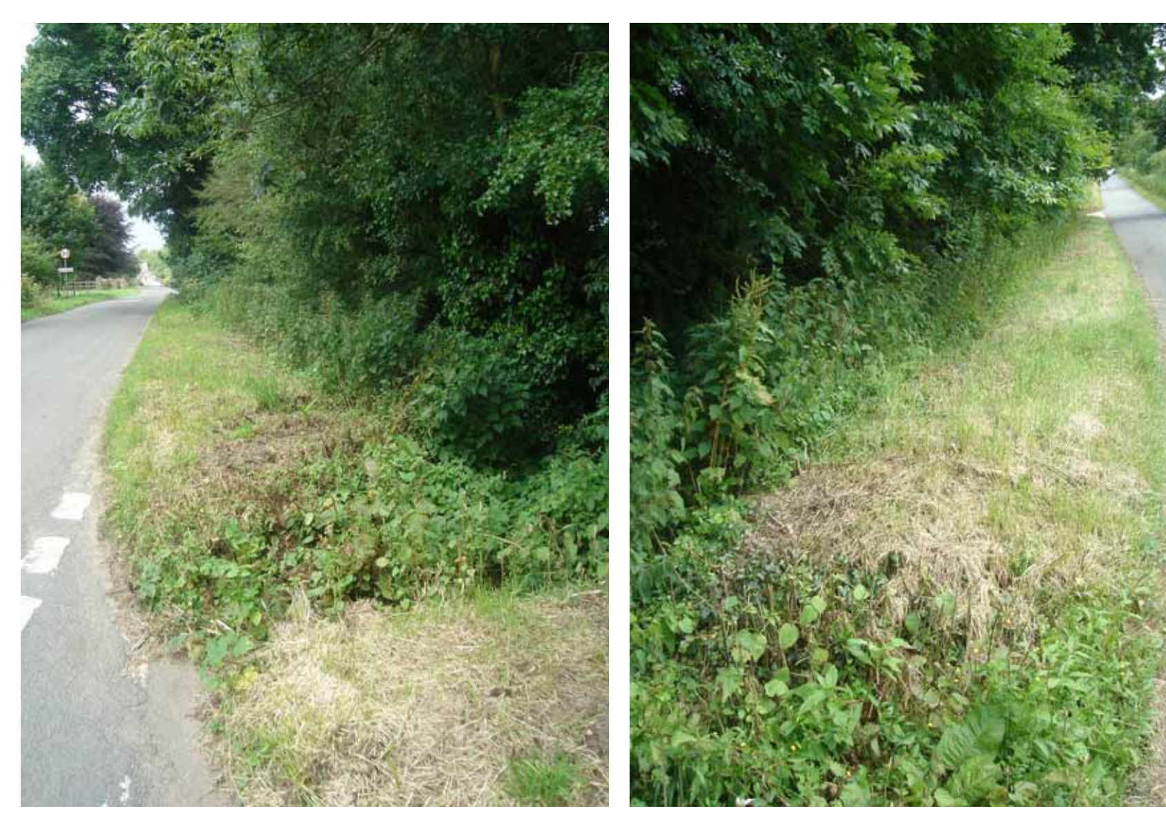
Area 2 – blocked ditch on north side Burford road looking towards Taynton