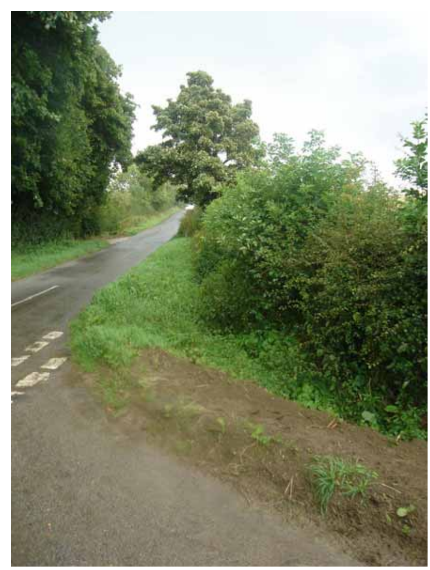
Area 2 – blocked ditch on south –east side B4437