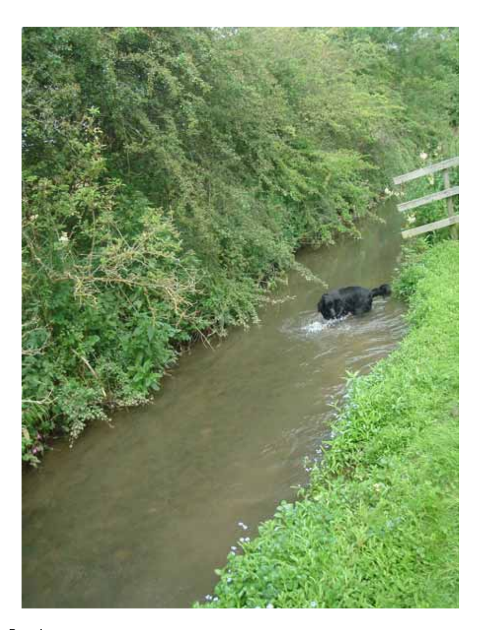
Area 1 – Coombe Brook