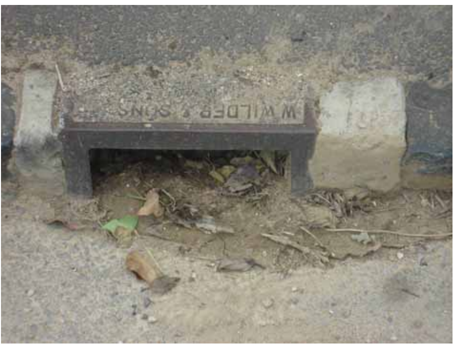
Area 1 – blocked kerb inlet gullies