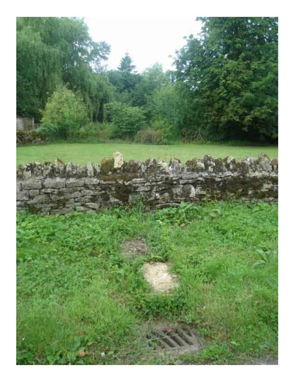
Area 1 - Culverts into grassland adjacent to Coombe Brook 19 of 32