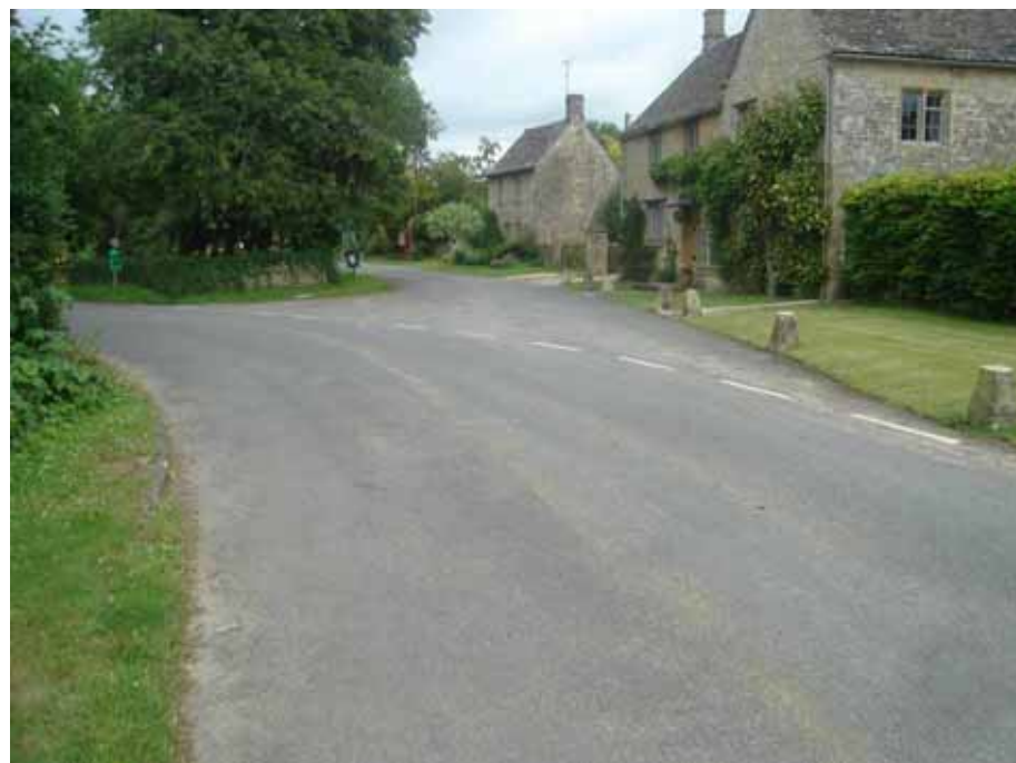
Area 1 – Roads affected by flooding