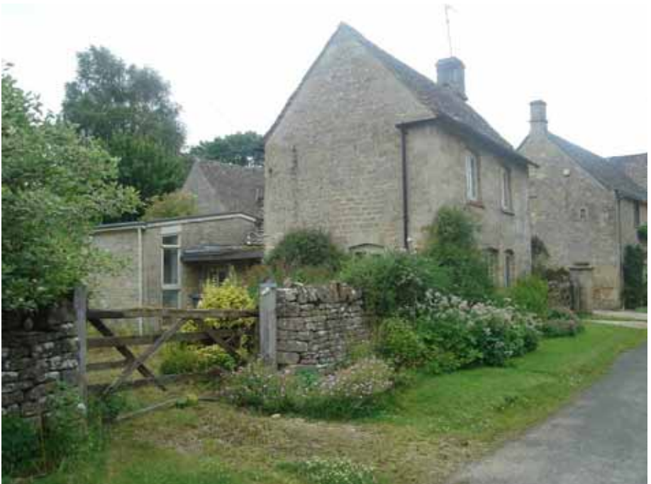
Area 1 – Vicinity where ditch maintenance is required