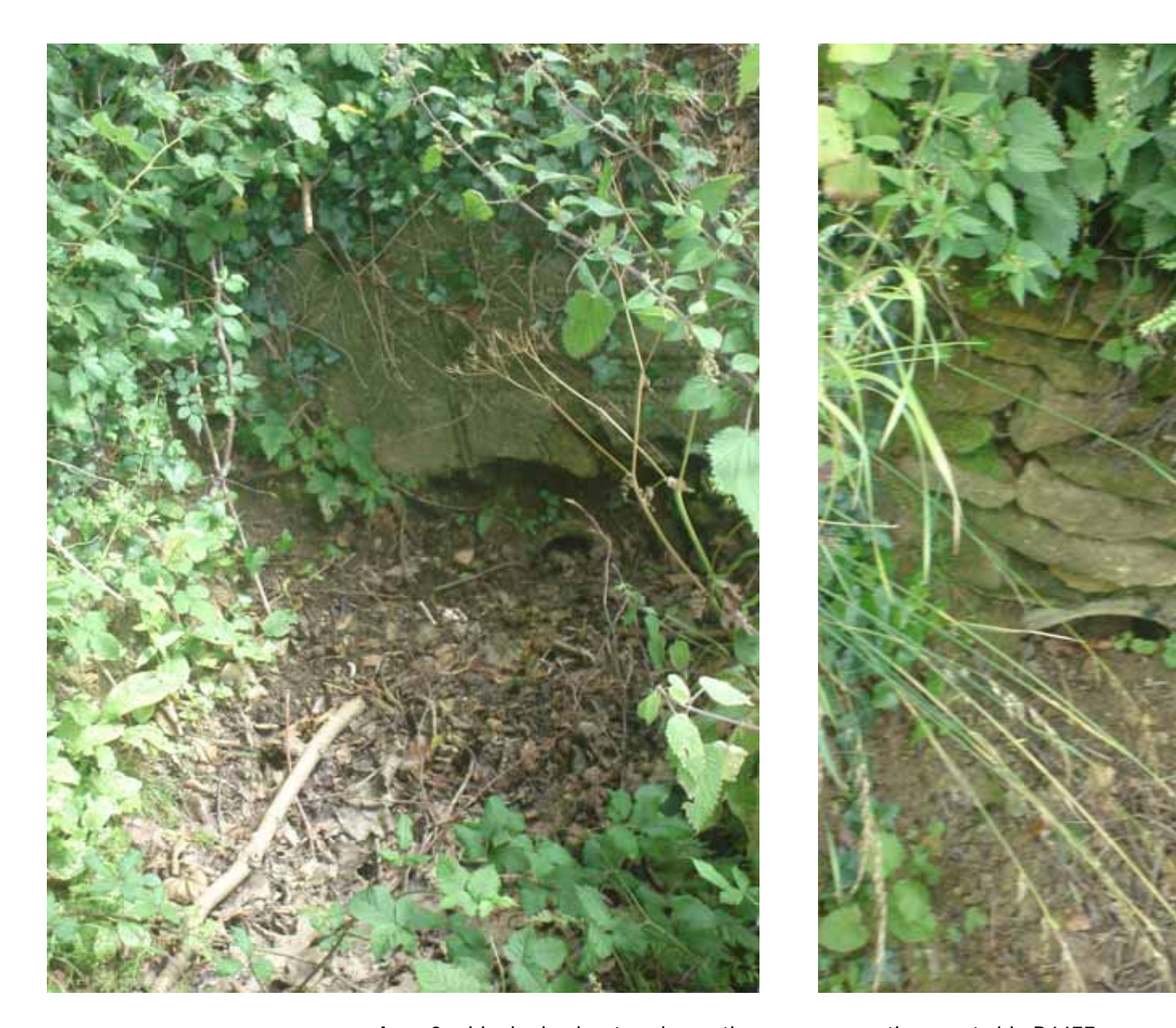
Area 2 – blocked culvert underneath access on north – west side B4477