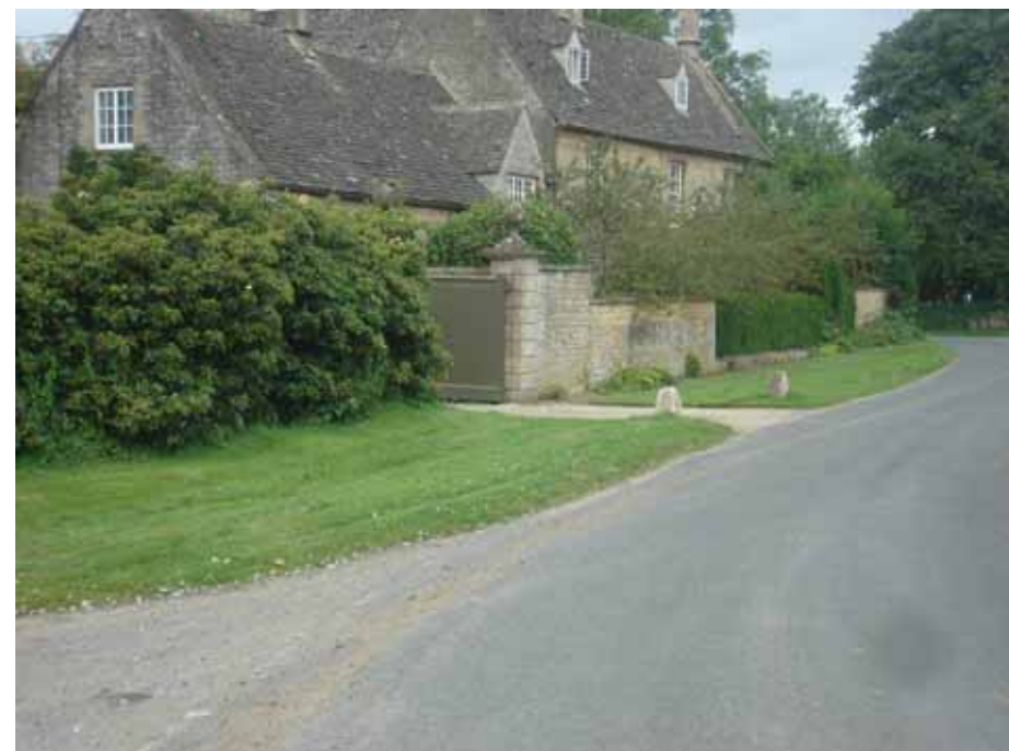
Area 1 – Roads affected by flooding