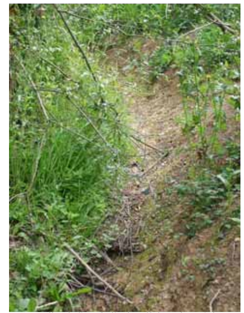
Area 1 – Badly defined ditch off South Leigh Road