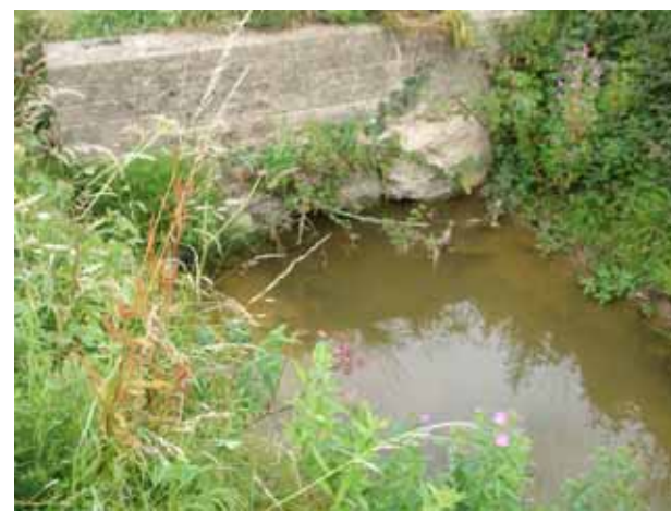
Area 1 – Culvert at Limb Brook