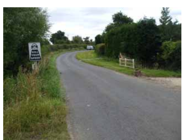
Area 1 – Culvert under South Leigh Road