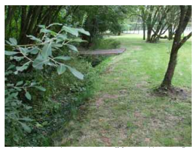
Area 4- Ditches in private property off Stanton Harcourt Road