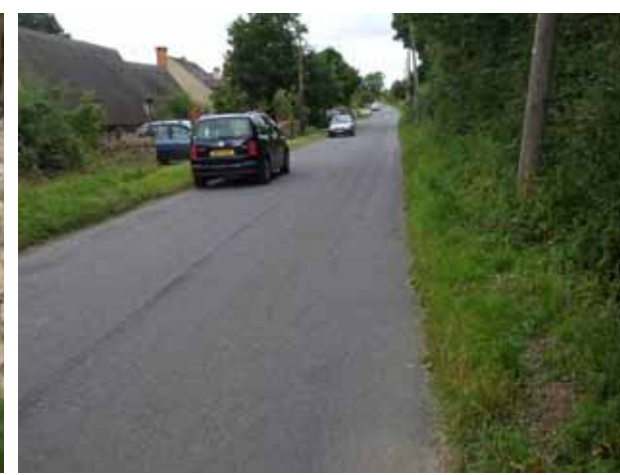
Area 2 - Culverts cross under Chapel Road at this point