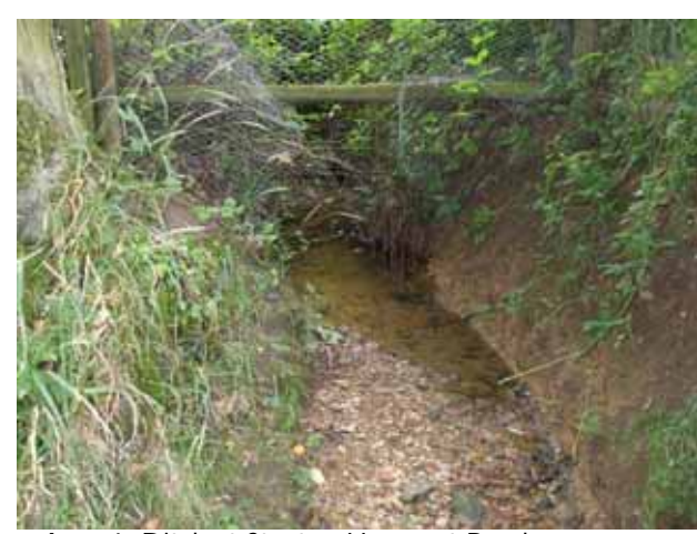
Area 4- Ditch at Stanton Harcourt Road