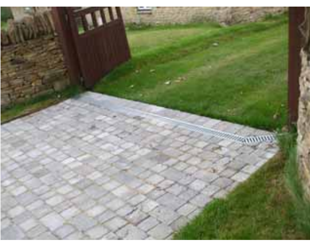
Area 2 - Cut-off drained installed at Chapel Road