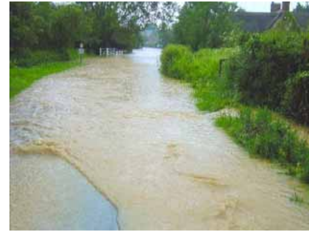
Area 3- Flooding at Margery Cross