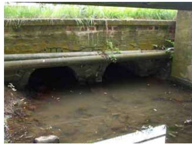
Area 3 – Brick arch culvert at Margery Cross