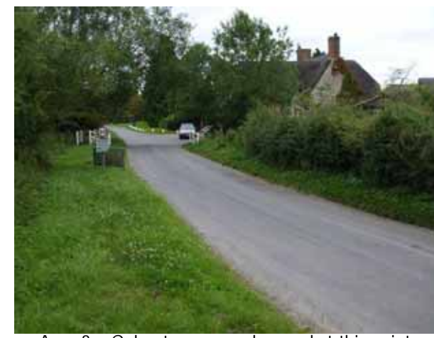
Area 3 – Culverts cross under road at this point