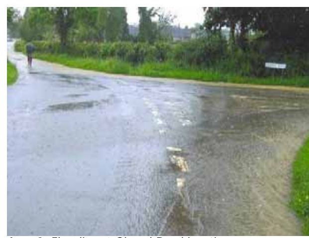
Area 2- Flooding at Chapel Road junction