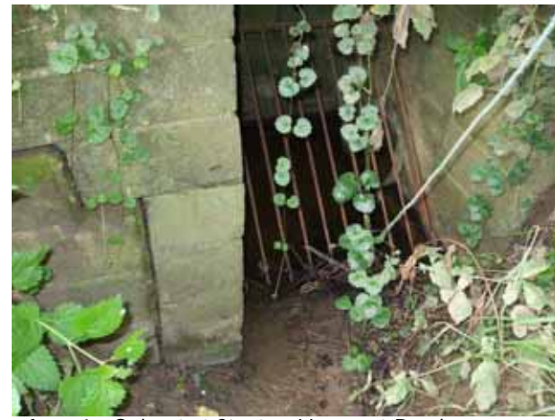
Area 4 - Culvert at Stanton Harcourt Road