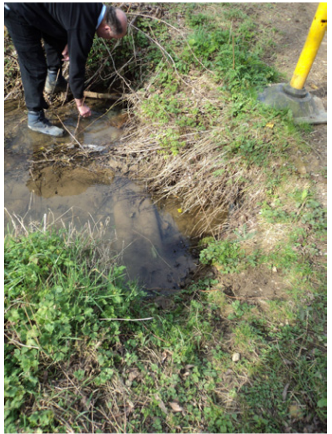
Existing southern electric pipe obstructing flow of ditch