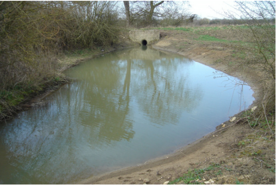
Photograph of the pond near the golf course; last cleared March 2010