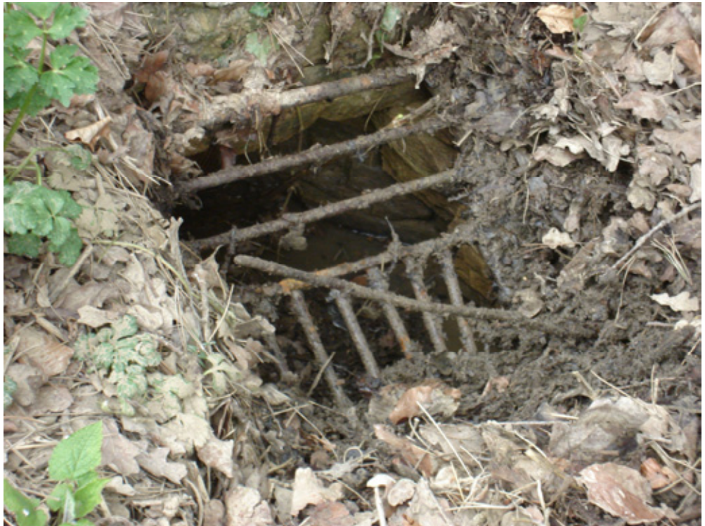
Culvert grid at The Leys, Lyneham March 2009