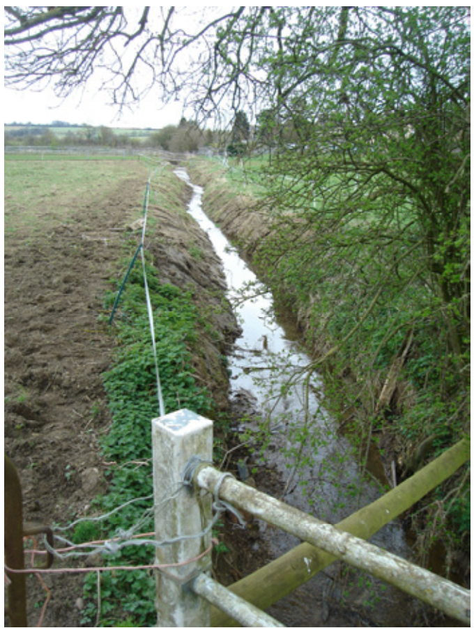
Upstream of the Priory Lane culvert March 2009