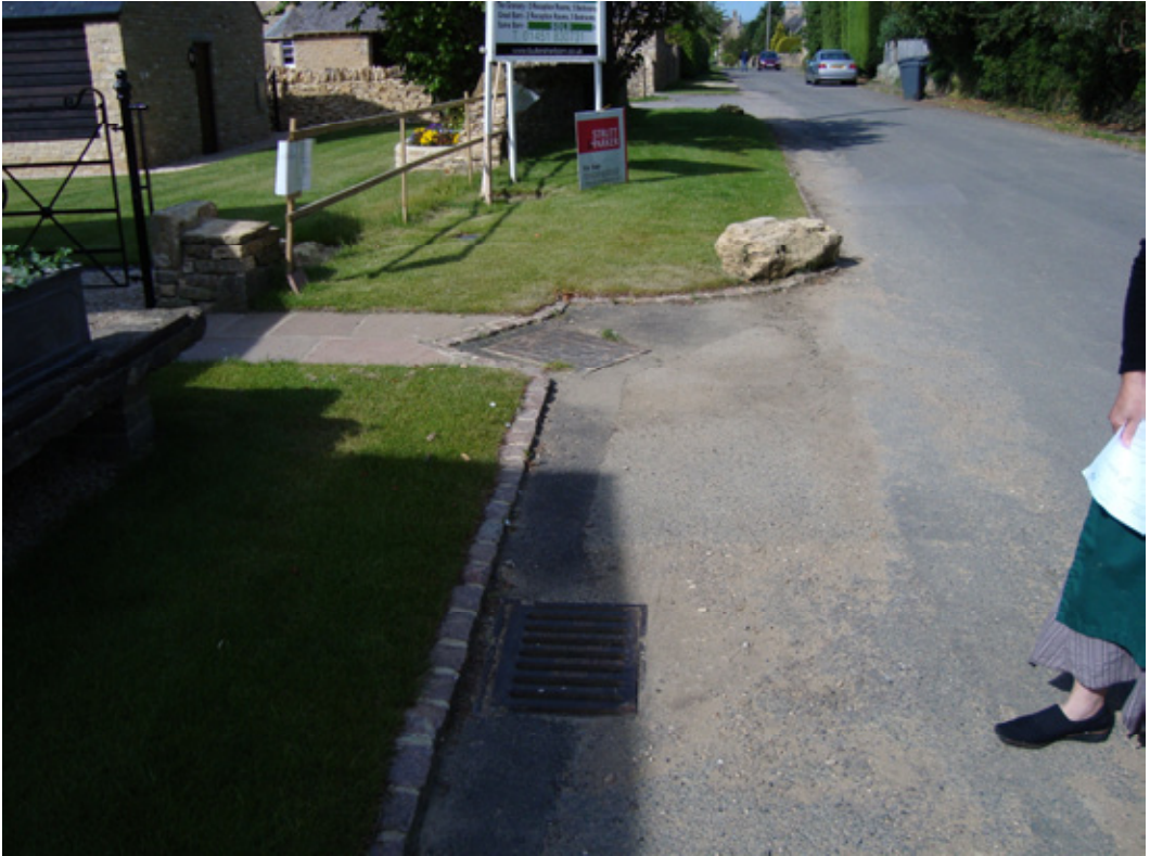
Highway drainage on High Street, Lyneham