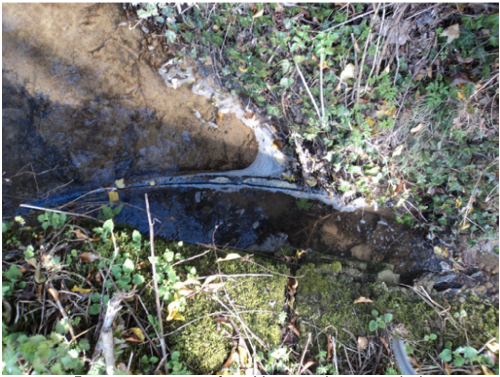
Existing services pipe from Maricote obstructing ditch