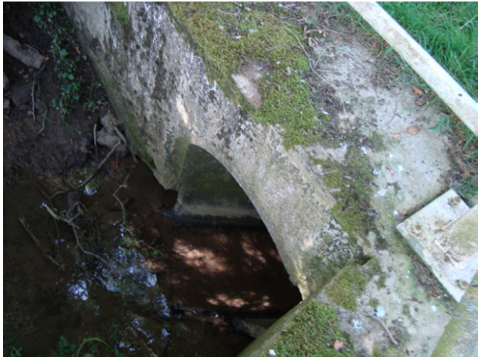
Priory Lane culvert June 2009