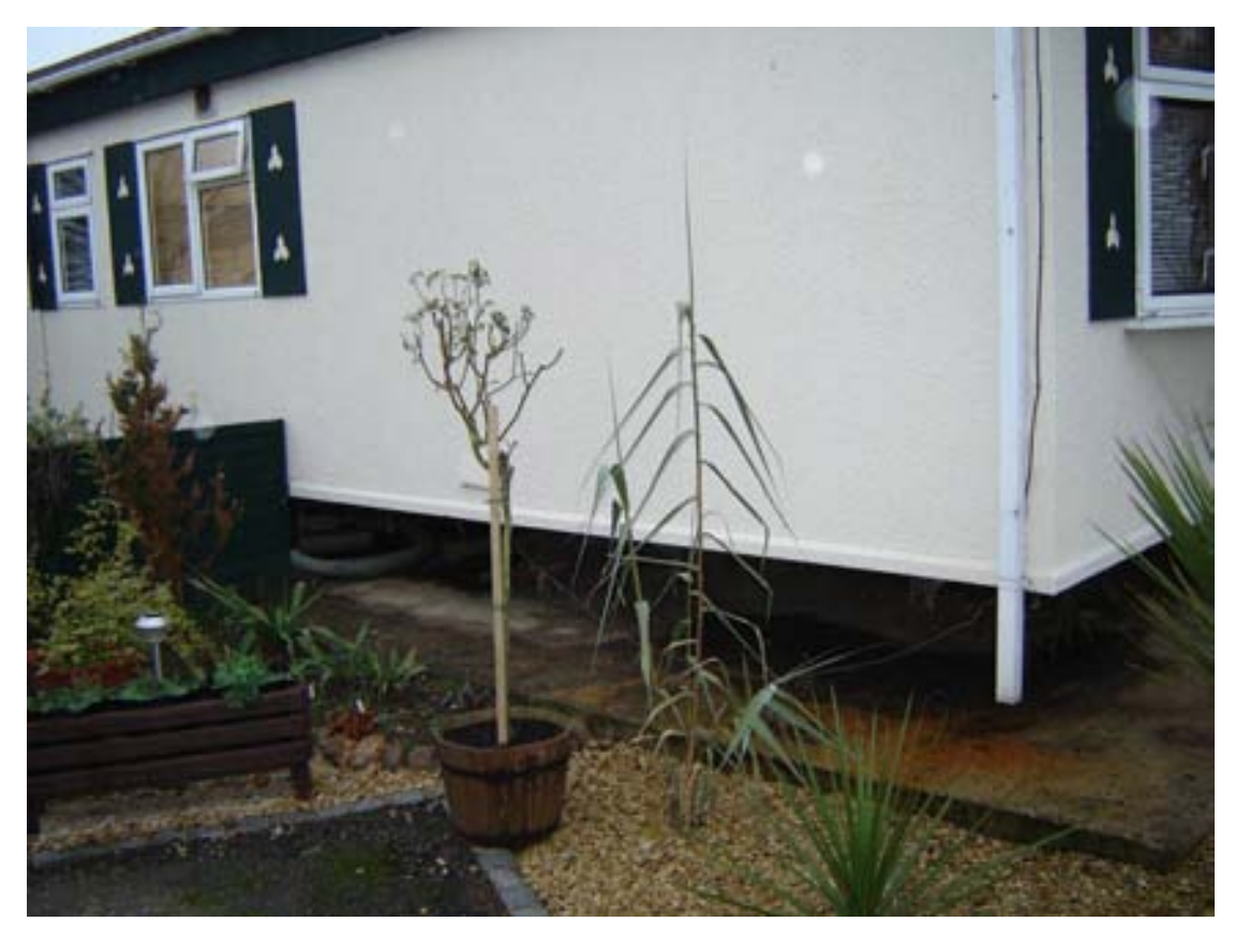
Area I – Bablock Hythe Caravan at Thameside Caravan Park jacked up by 300mm