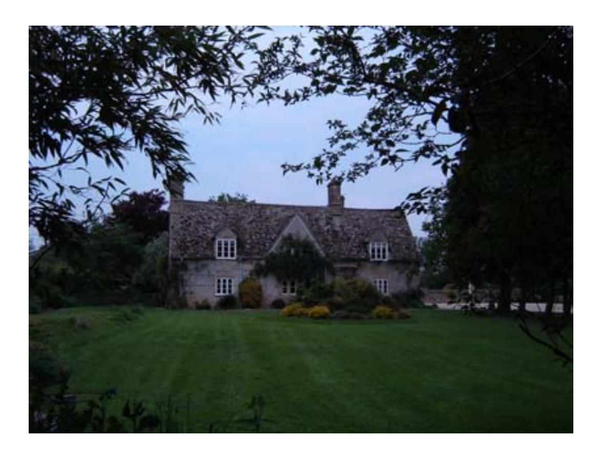
Area 3 - Moreton