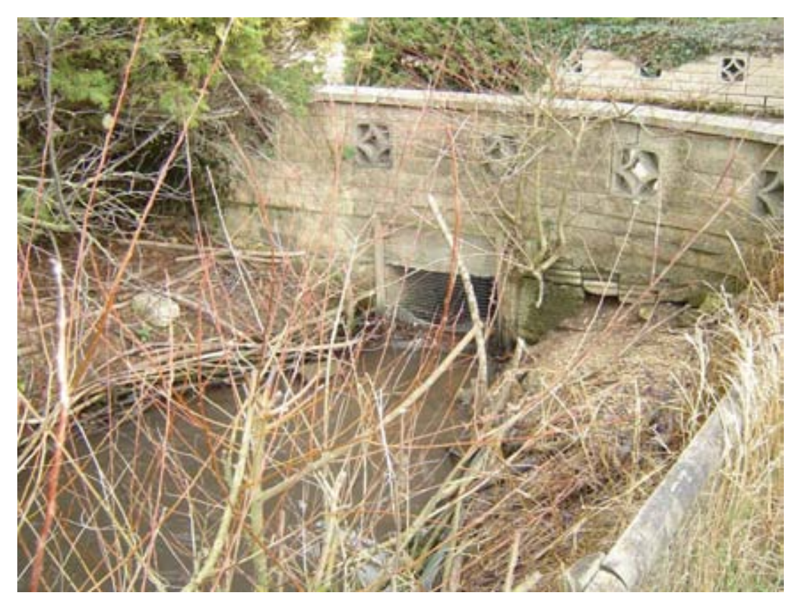
Area 2 - Northmoor Village Choked village brookcourse culvert to be cleared out and culvert upsized