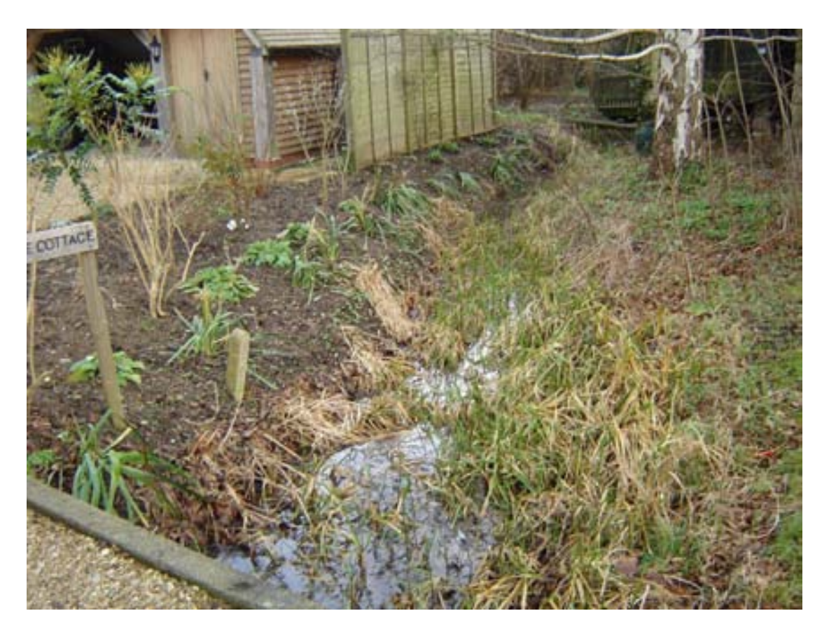
Area 2 – Northmoor Village Overgrown village brookcourse requiring cleaning out and ditch re-profiled