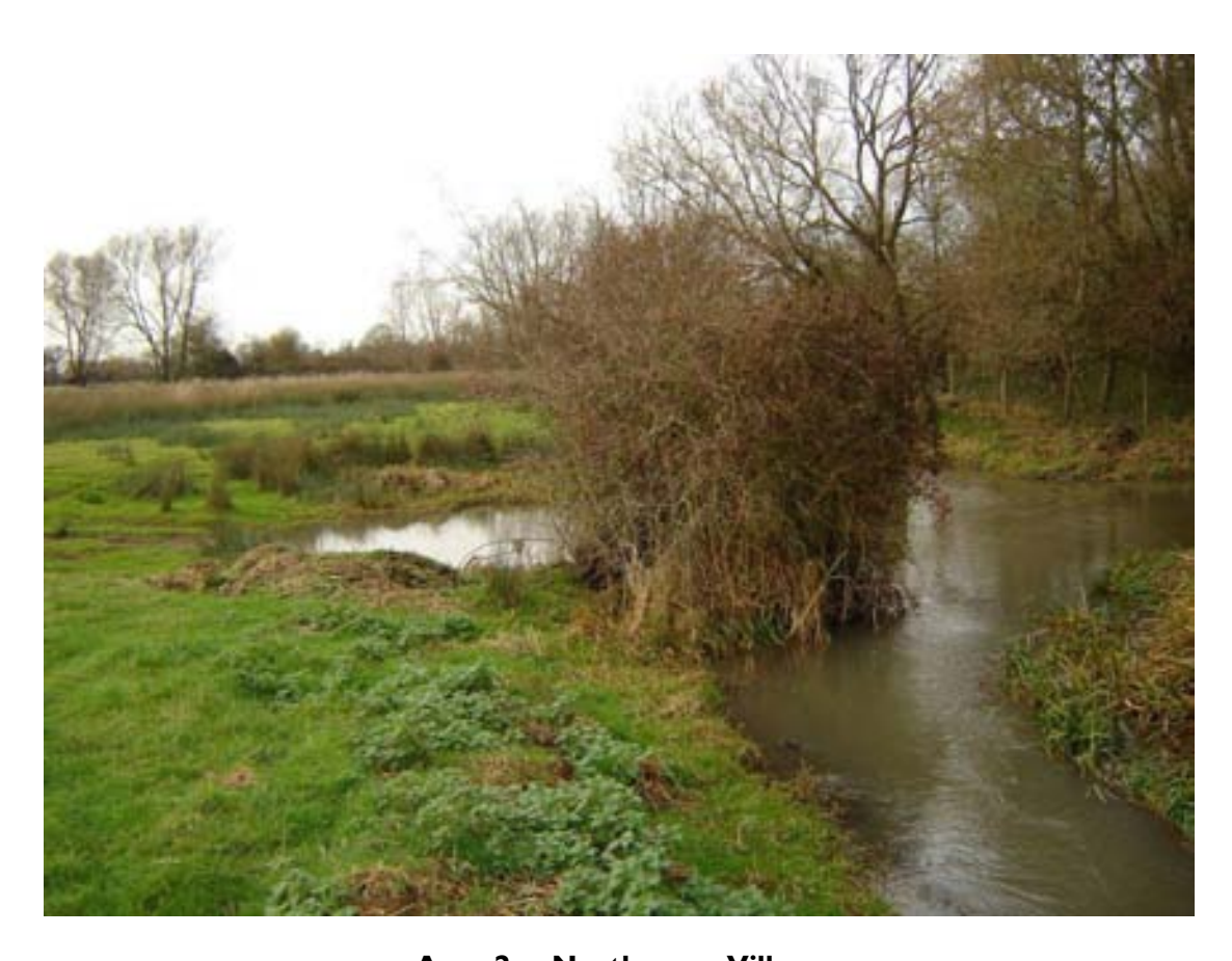
Area 2 - Northmoor Village River tributaries south of Northmoor village requiring improved management to assist village run-off