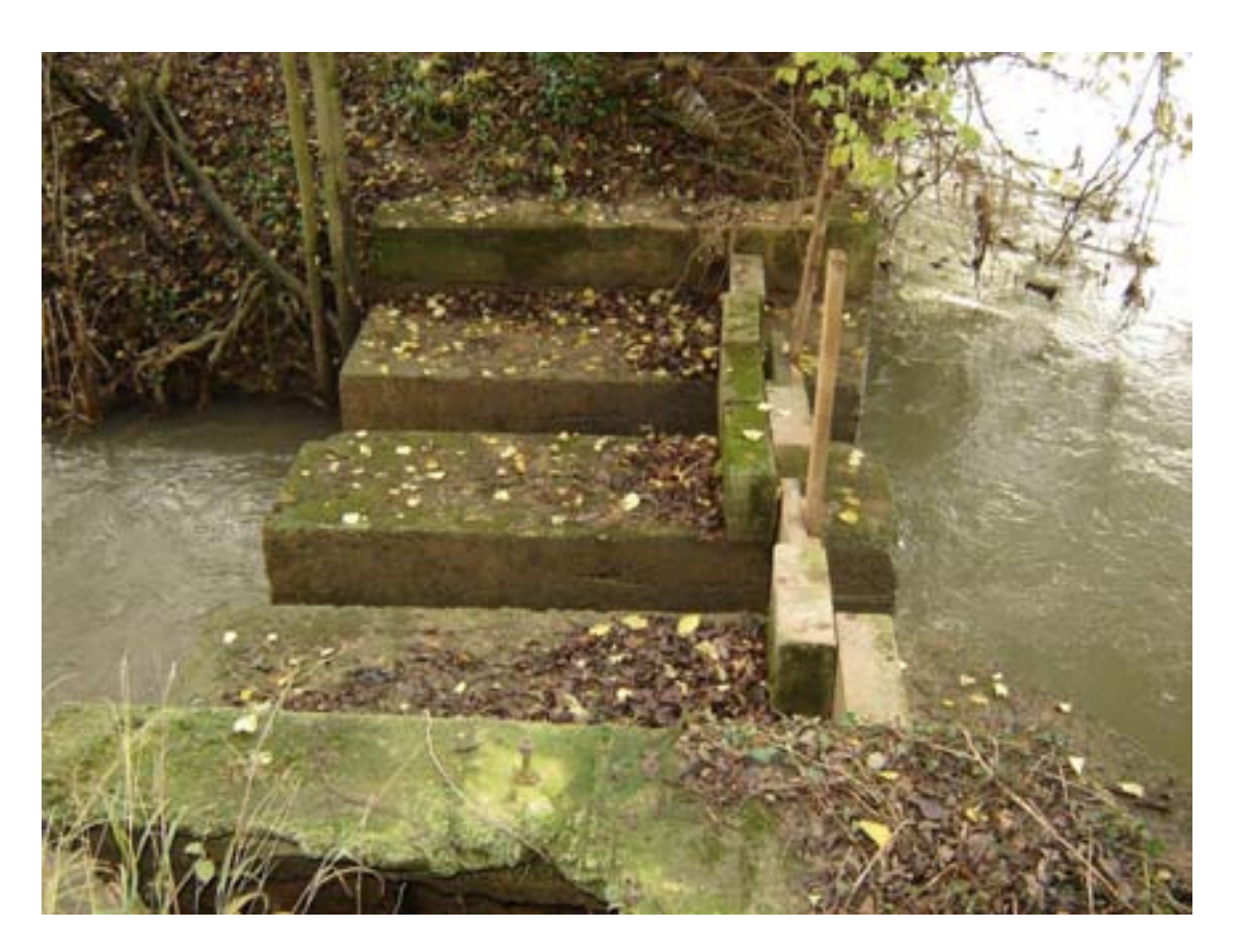
Area 2 – Northmoor Village Sluice gate between River and adjacent watercourse to be repaired and maintained regularly