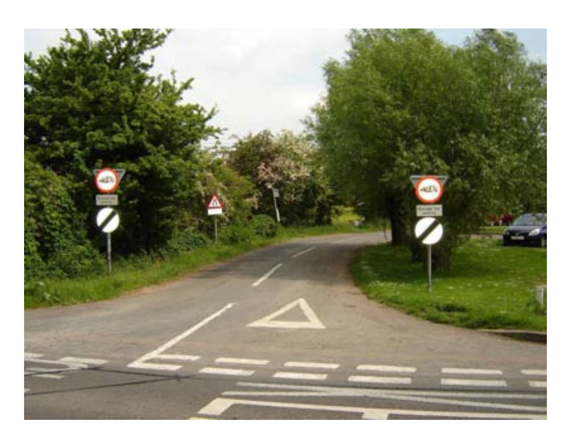
Area 3 - Moreton