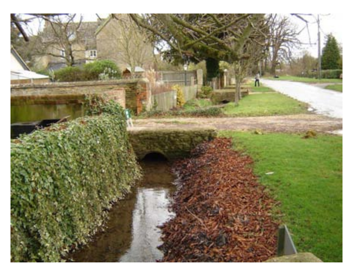
Area 2 - Northmoor Village Village brookcourse requiring upsizing of crossing culverts