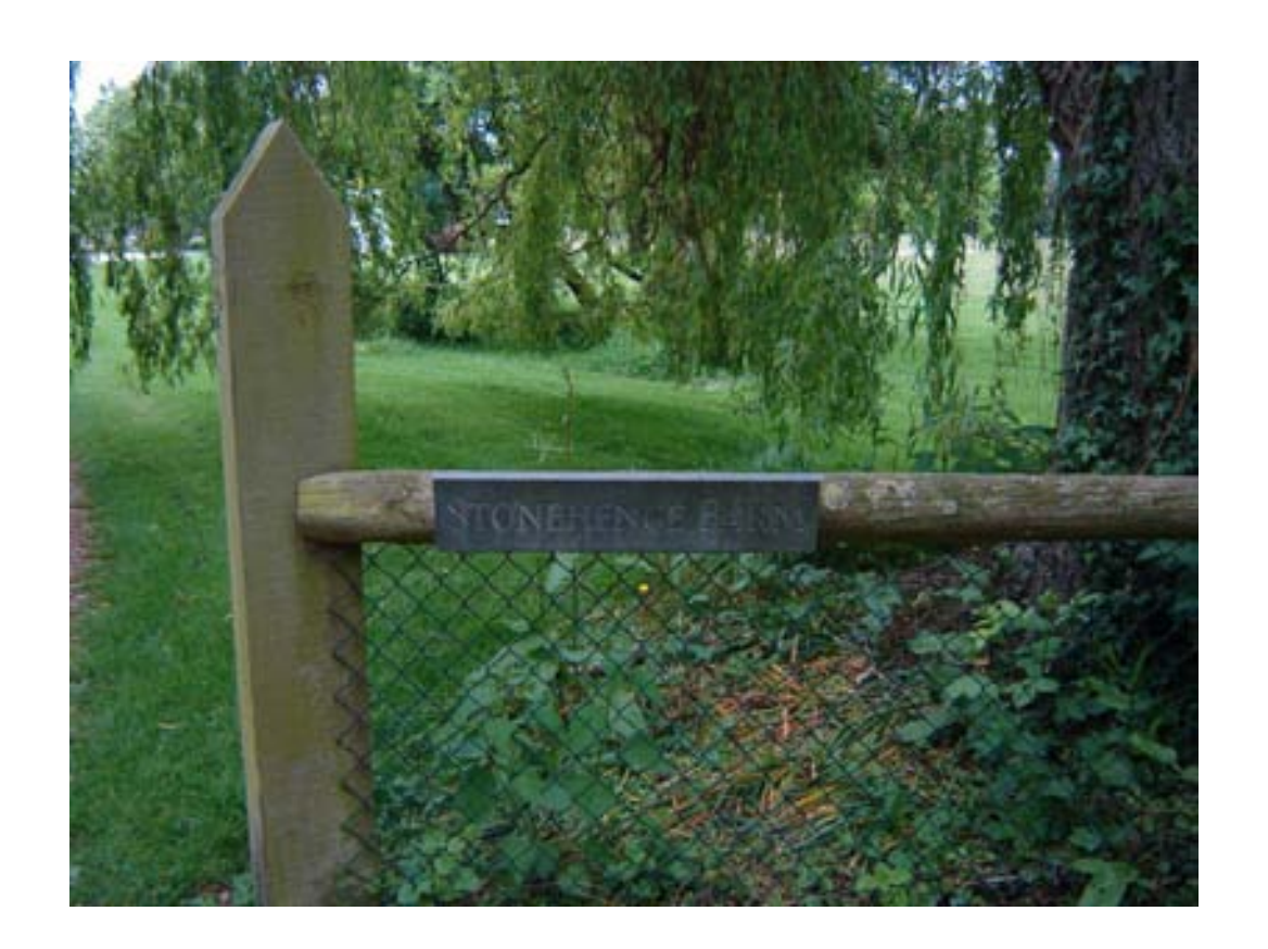
Area 3 - Moreton