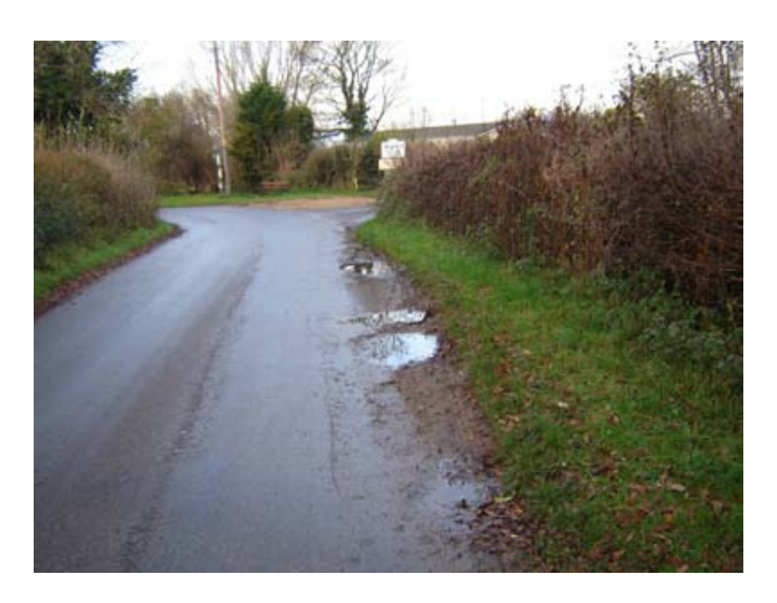
Area I – Bablock Hythe Entrance to Thameside Caravan Park showing locations where road gully improvements required