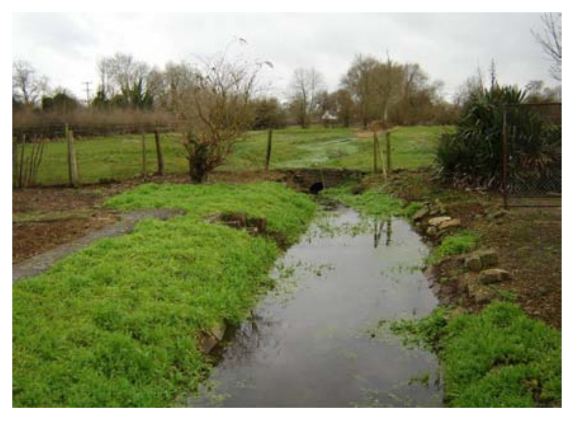
Area 2 – Northmoor Village Choked village brookcourse at "Waylands" requiring cleaning out and ditch re-profiled