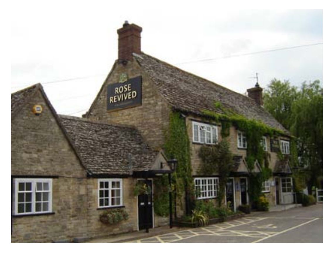
Area 3 - Moreton (Rose Revived PH)