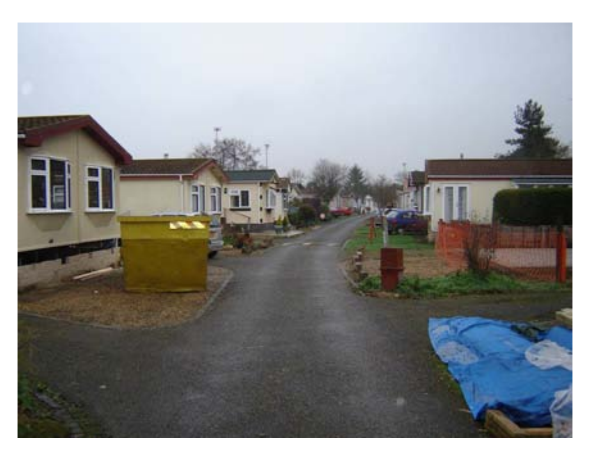
Area I – Bablock Hythe Thameside Caravan Park undergoing flood improvement works