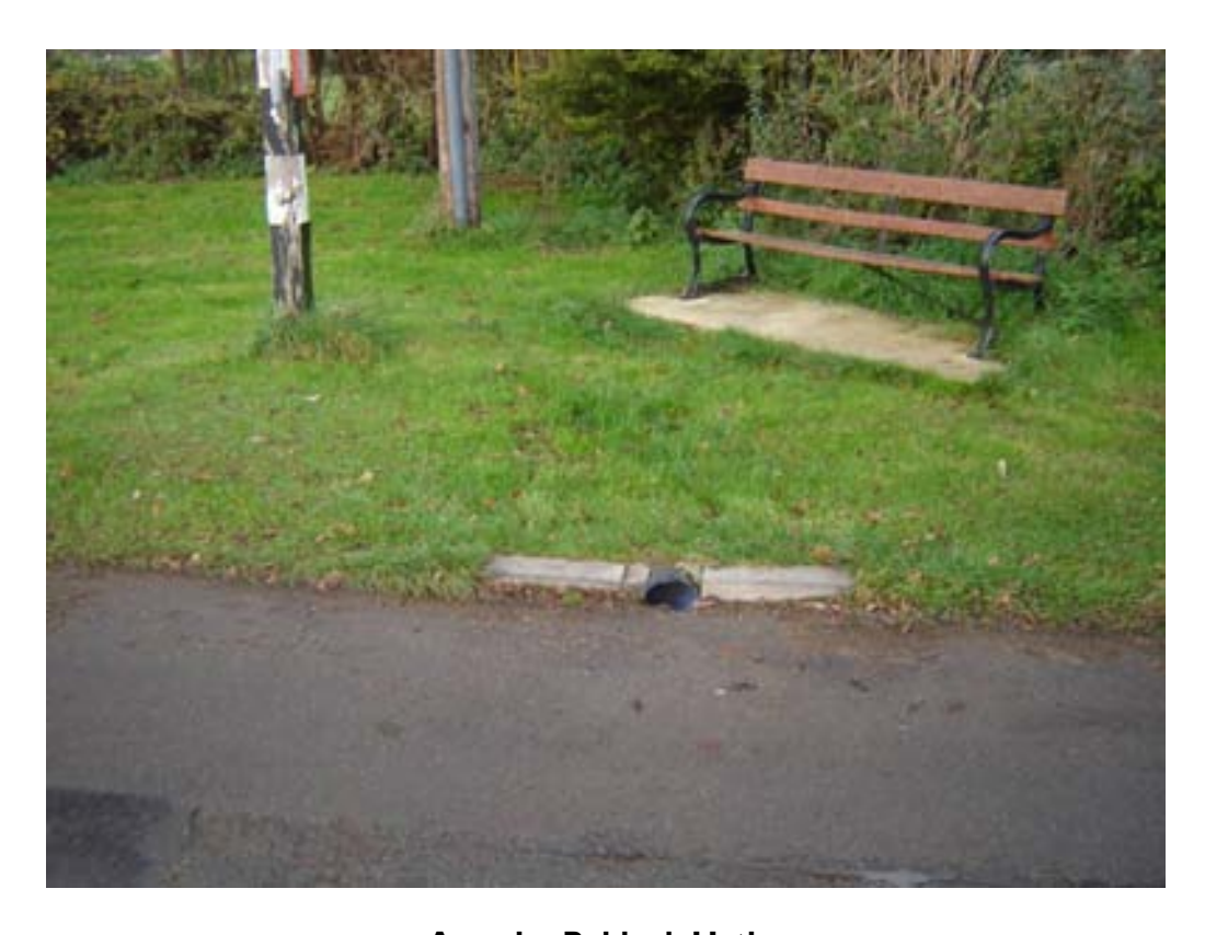
Area I – Bablock Hythe Entrance to Thameside Caravan Park showing locations where road gully improvements required