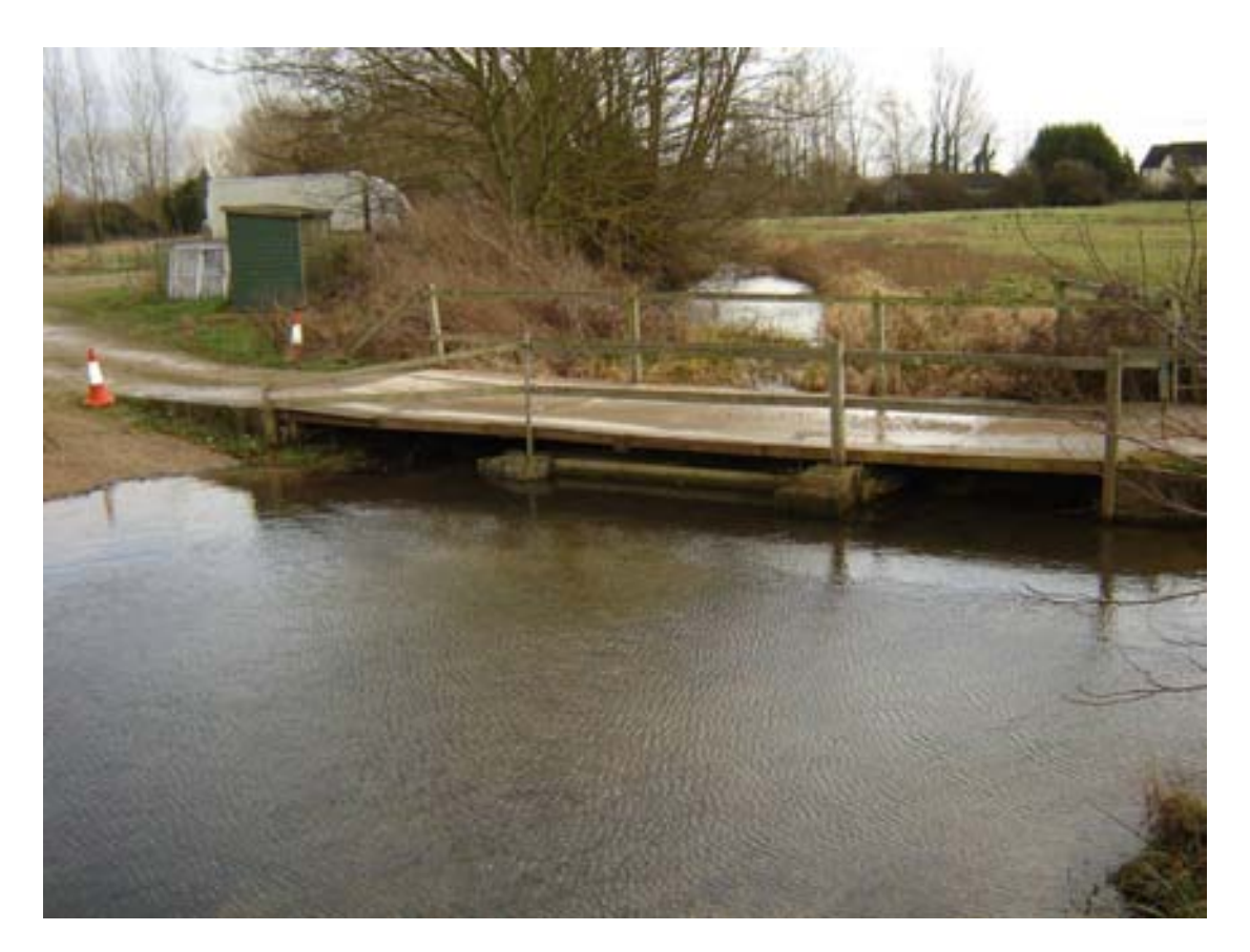
Area 2 - Northmoor Village Overgrown village brookcourse at Pinnocks Farm requiring cleaning out