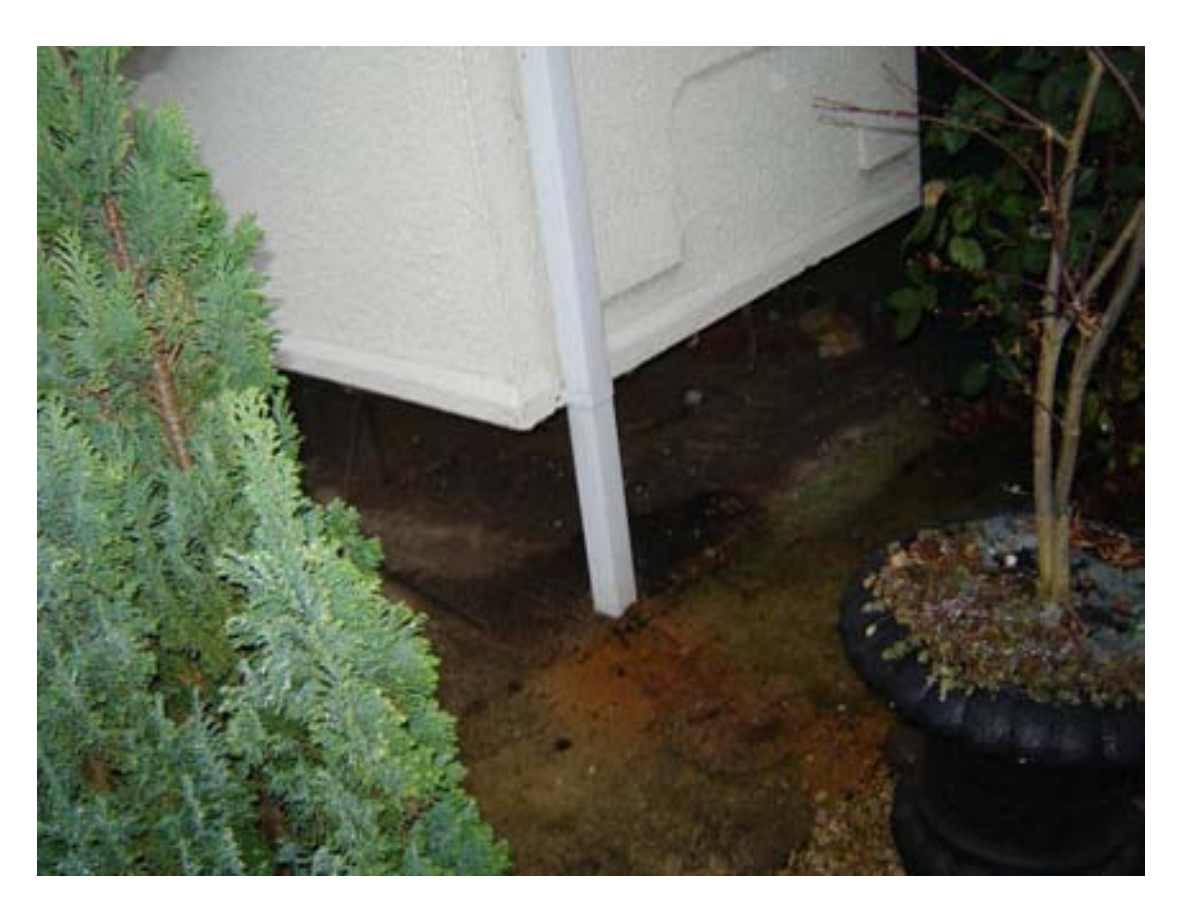
Area I – Bablock Hythe Flooded caravan at Thameside Caravan Park to be raised by 300mm