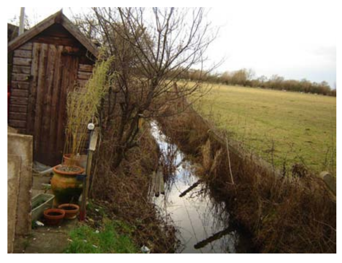
Area I – Bablock Hythe Thameside Caravan Park northern boundary ditch to be cleared out