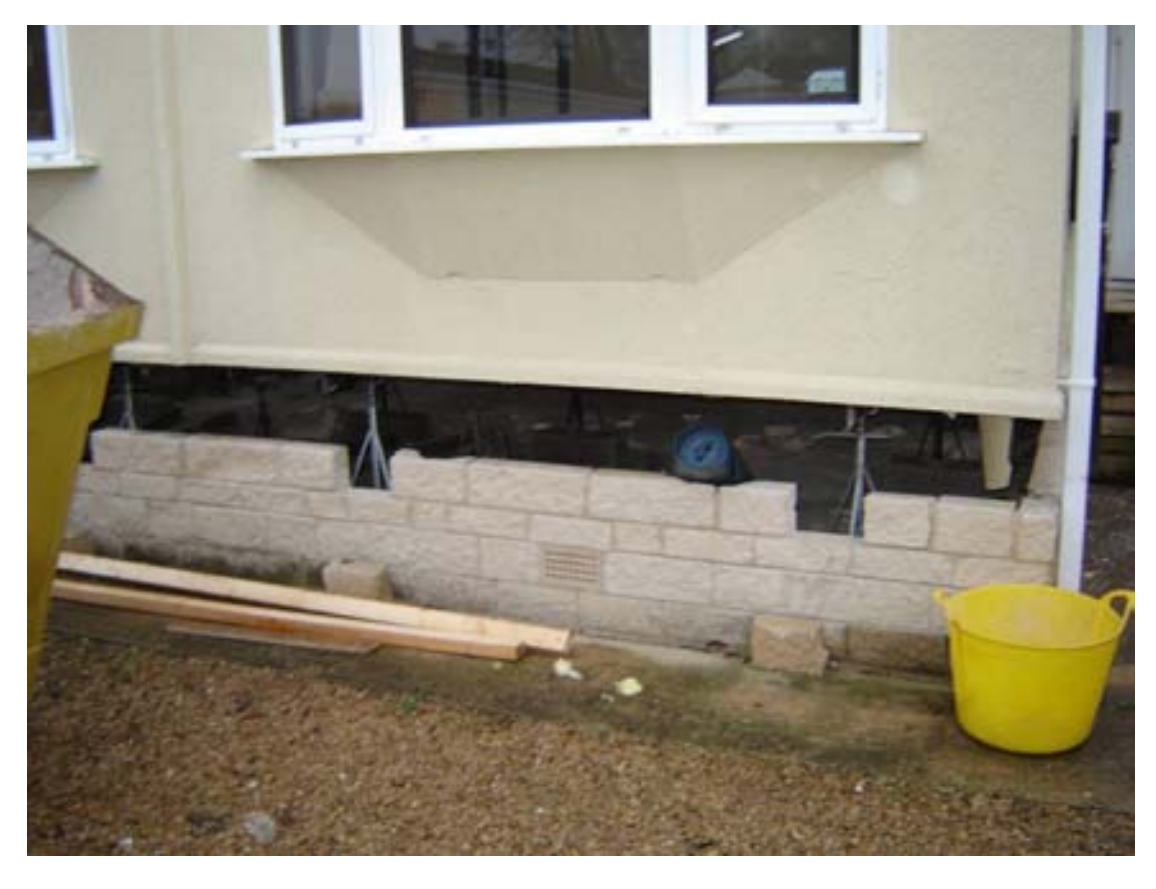
Area I – Bablock Hythe Caravan at Thameside Caravan Park jacked up by 300mm