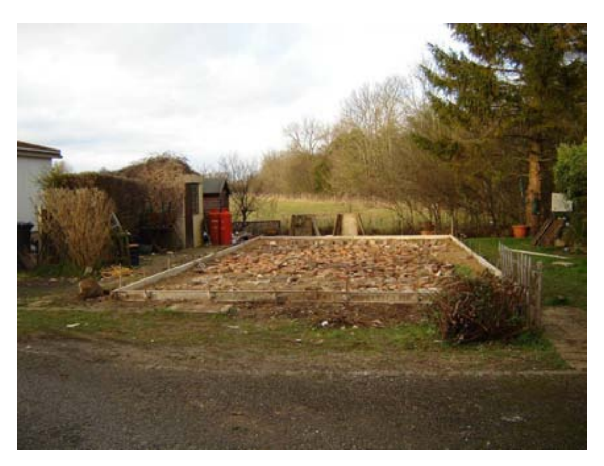
Area I – Bablock Hythe Caravan at Thameside Caravan Park demolished as a consequence of severe flood damage