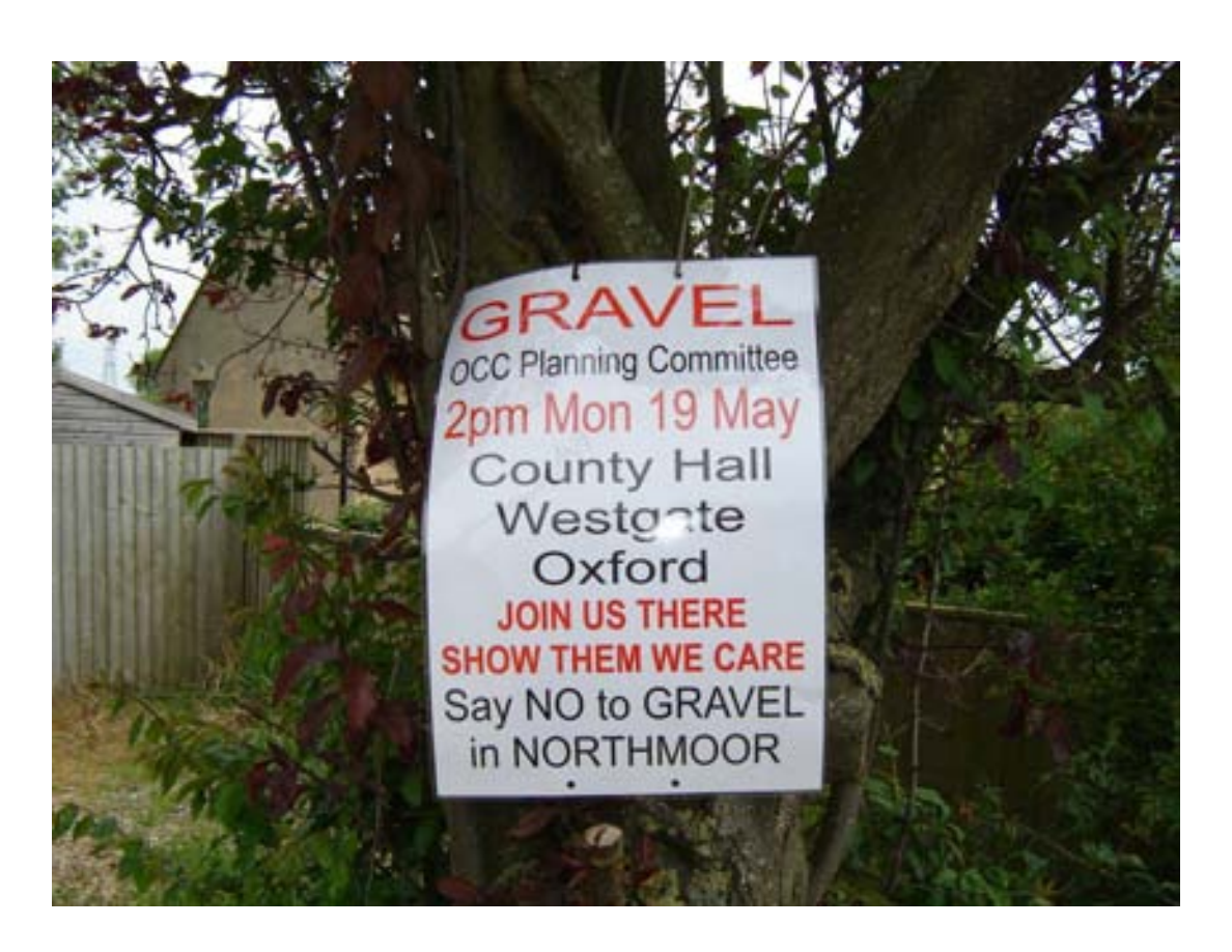
Area 3 - Moreton (Gravel Poster)