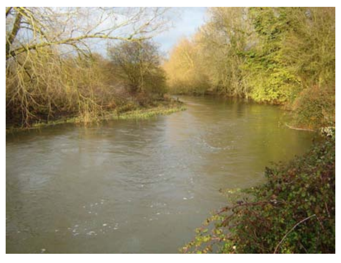
Area 2 - Northmoor Village River Windrush south of Northmoor village