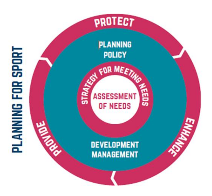
Figure 3.1: Sport England themes